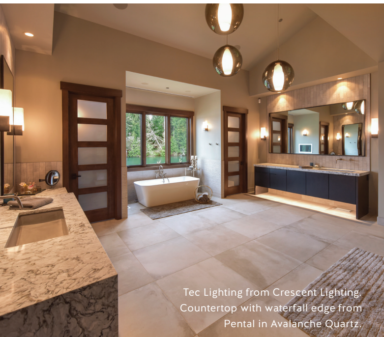
Tec Lighting from Crescent Lighting. Countertop with waterfall edge from Pental in Avalanche Quartz.