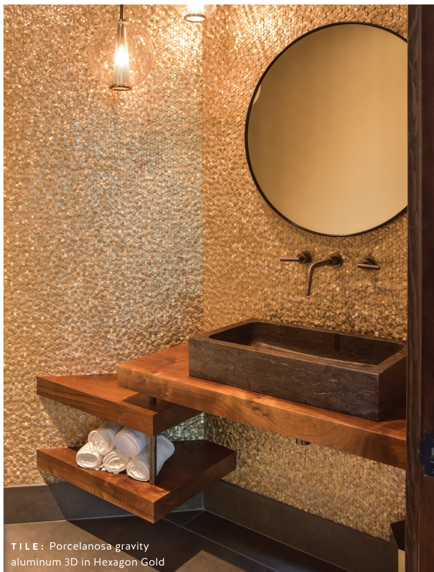
TILE: Porcelanosa gravity aluminum 3D in Hexagon Gold

The biggest challenges were constructing the soaring 30-foot timber roof framing and all the engineering that went into creating this massive masterpiece of a home.