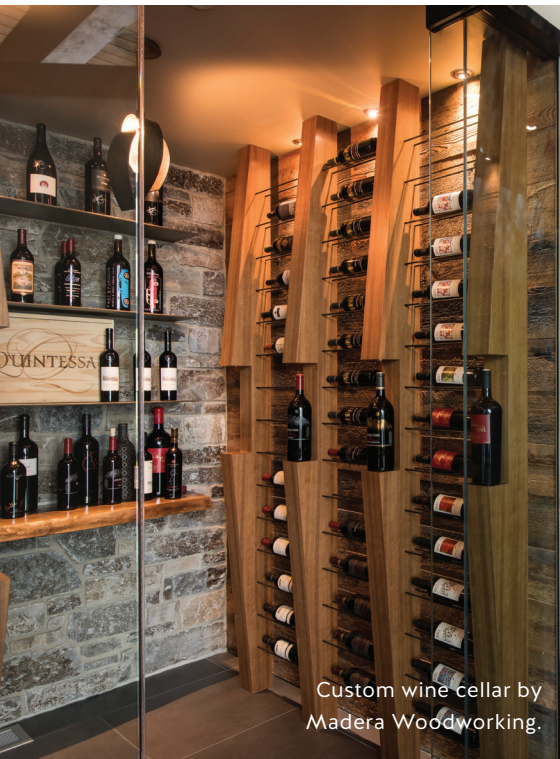
Custom wine cellar by Madera Woodworking.

Cheers to this lovely wine cellar and tasting room that is just as pretty as it is functional. It's right off the living and dining area and is climate-controlled.