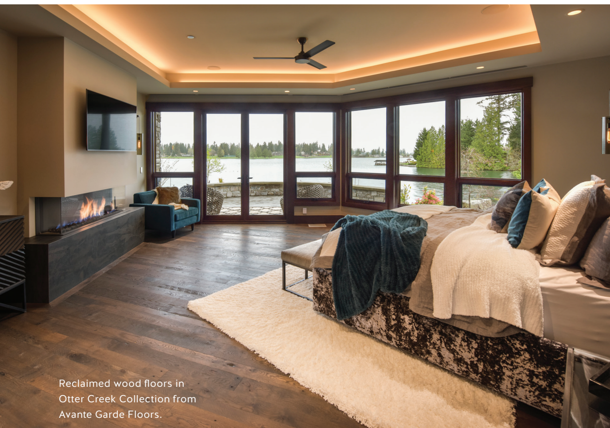
Reclaimed wood floors in Otter Creek Collection from Avante Garde Floors.

The master suite closet is bigger than most people's bedrooms – check out the stunning light over the island in the middle. There is even a lake view. Imagine how many shoes and purses you could store here.