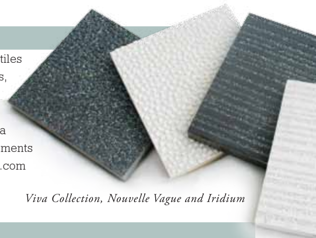
Viva Collection, Nouvelle Vague and Iridium

Imagine these beautiful, dazzling tiles in a powder bath on all of the walls, bordering a mirror, or as a tub surround in a residential application, or behind a reception desk in a commercial space. Available at Statements Tile in Seattle. Details: statementstile.com